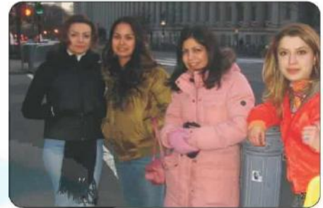
A very cold day

Sometimes it rains and we feel colder. We wear woollen clothes on a cold day. We like to eat and drink hot things. In winters it snow also falls in the mountains.