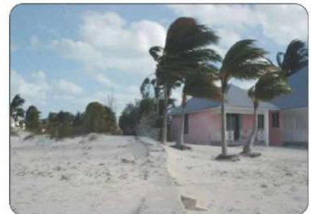
A windy day

Moving air is called wind . Somedays, the wind blows very strongly. These are called windy days . A windy day is mostly cool. These winds sometimes become storms. The trees keep swaying, sometimes the trees fall. We should not go outdoors on a windy day.