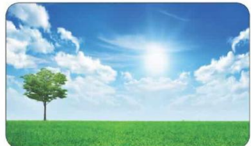
A hot and sunny day

On a sunny day, the sun shines brightly. The weather is hot. We wear cotton clothes on a hot day.